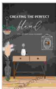
Image alt: The 2024 Diffuser Blend Calendar, a beautifully designed calendar featuring 365 unique diffuser blends.

Don't miss out on this opportunity to transform your home and well-being with the 2024 Diffuser Blend Calendar. Free Download your copy today and embark on a year-long journey of aromatic exploration and sensory delight. Your senses will thank you!