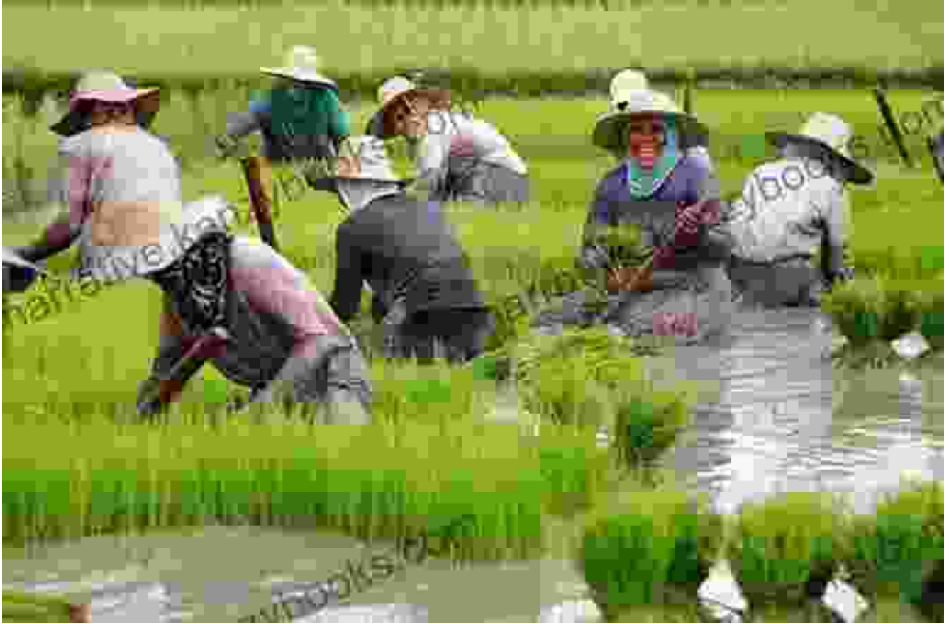
Farmers harvesting crops in a field, showcasing the vital role of agricultural workers in feeding the nation.